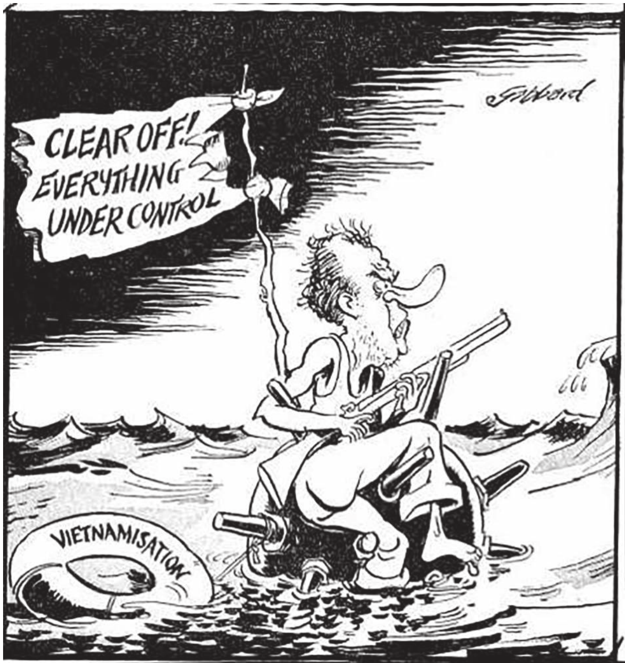
A cartoon published in a British newspaper, 1971. It shows Nixon sitting on a floating bomb.