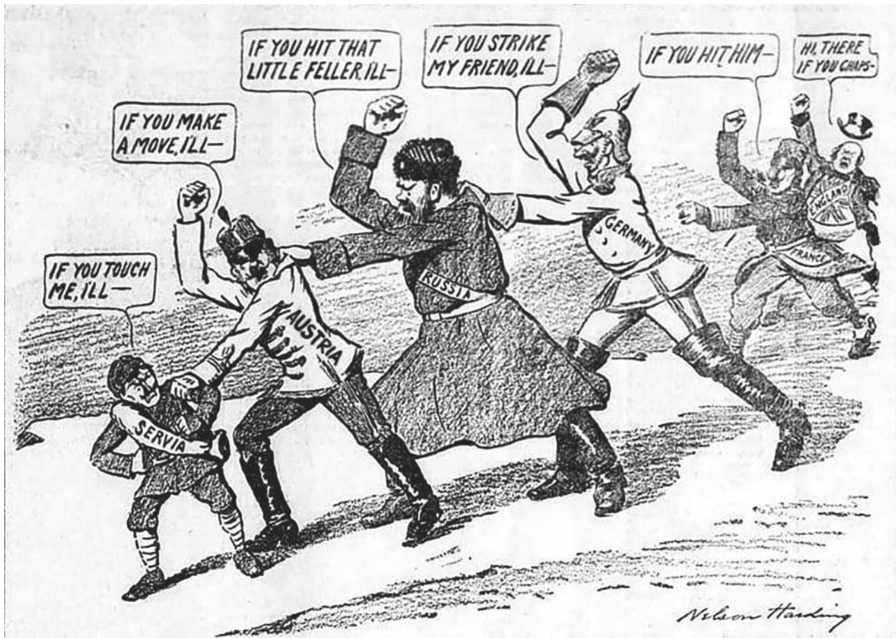
A cartoon published in an American newspaper with the title 'The Chain of Friendship', July 1914.